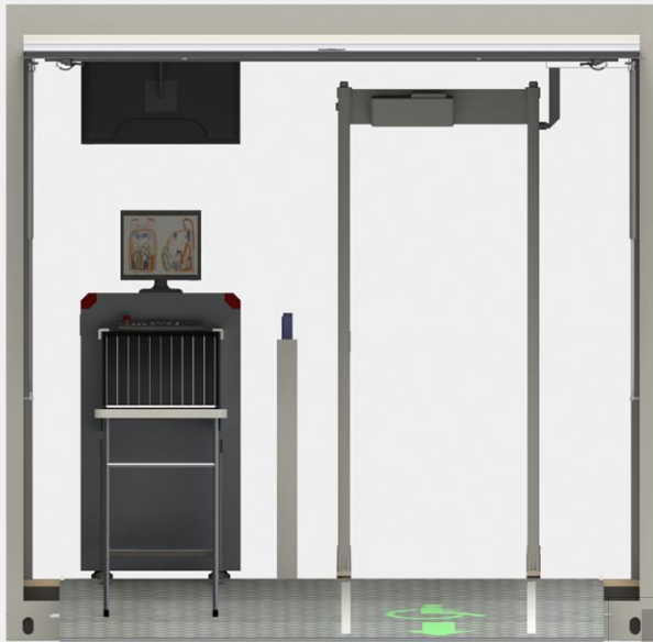
Fig.5 3D illustration - View of the exit