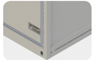
Fig.7 Locking handle