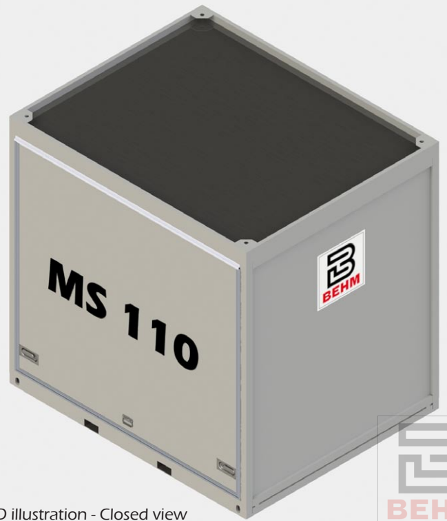
Fig.6 3D illustration - Closed view