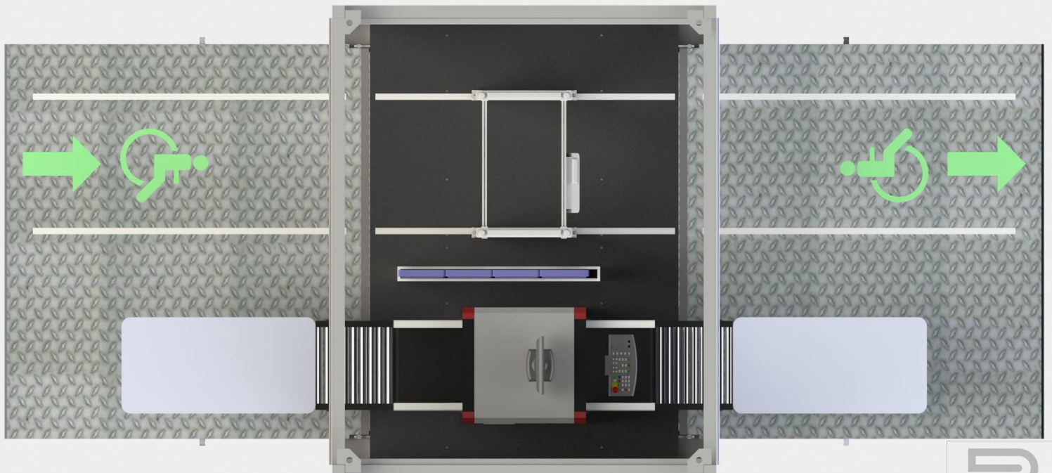
Fig.4 3D illustration - Top view of deployed module