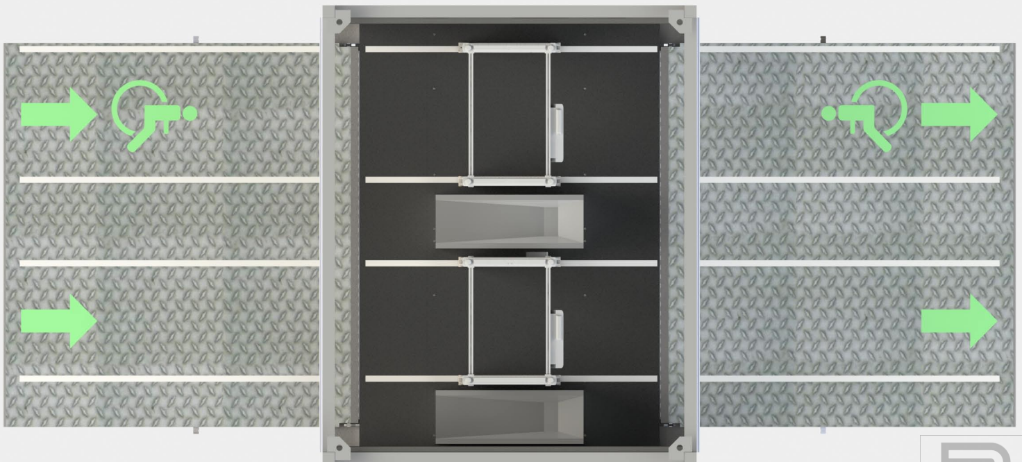
Fig.4 3D illustration - Top view of deployed module