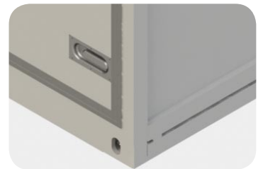
Fig.7 Locking handle