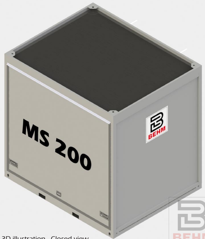
Fig.6 3D illustration - Closed view