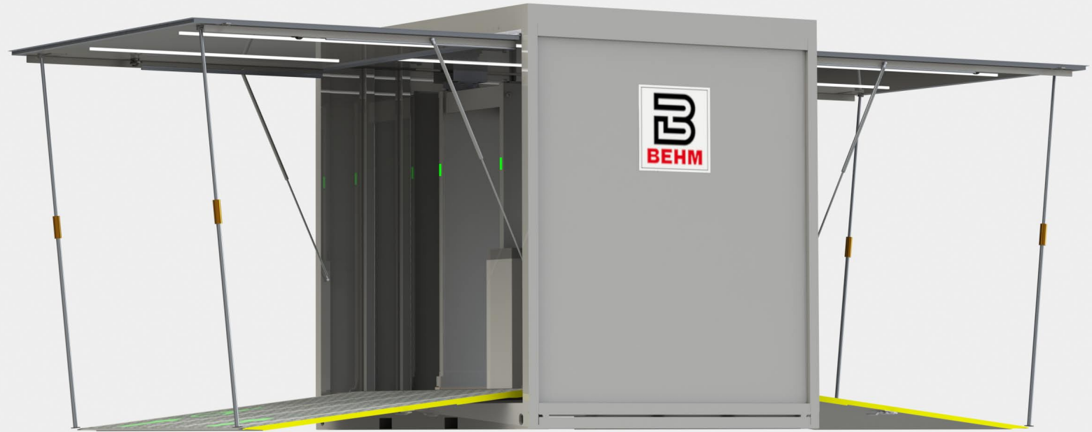
Fig.5 3D illustration - View of the exit