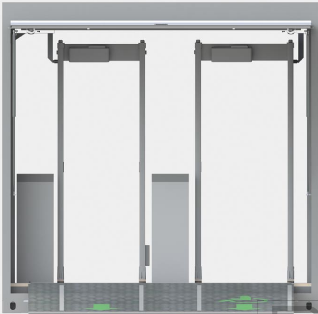
Fig.5 3D illustration - View of the exit side